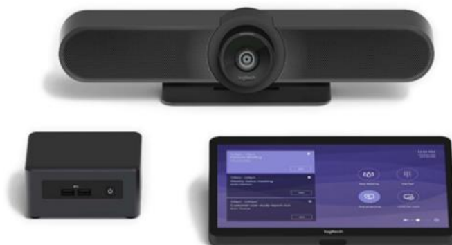
Figure 3: Logitech MeetUp in a Windows Microsoft Teams Rooms Bundle including a Logitech Tap Controller

MeetUp is a USB video bar that includes a 4K camera, a three-element beamforming mic array, and a custom-tuned speaker designed for use in small meeting rooms.