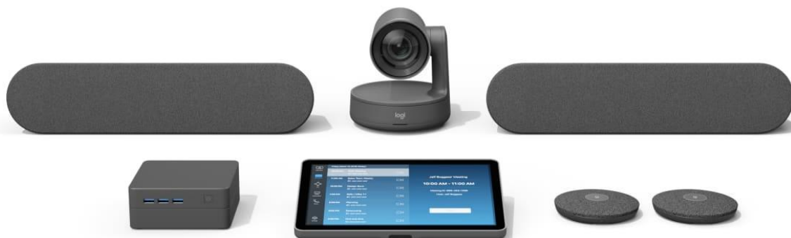
Figure 4: Logitech Rally Plus in a Zoom Rooms Bundle including a Logitech Tap Controller

Rally Plus is a modular video conferencing system that includes a 4K motorized pan/tilt/zoom camera, two speakers, and two mic pods. Rally Plus can support up to seven mic pods.