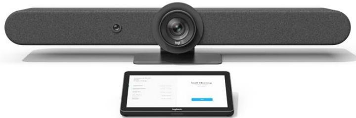
Figure 6: Logitech Rally Bar and a Tap Controller

Rally Bar is an Android video bar that includes a 4k camera, a six-element beamforming mic array, and two speakers designed for use in medium and large meeting rooms. Rally Bar also supports up to three expansion mics and offers Speaker Boost mode to serve larger rooms.