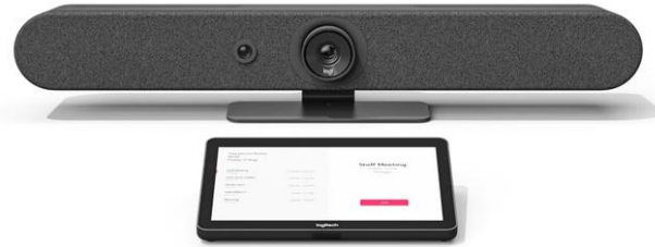
Figure 5: Logitech Rally Bar Mini and a Tap Controller

Rally Bar Mini is an Android video bar that includes a 4K camera, a six-element beamforming mic array, and two speakers designed for use in small and medium meeting rooms. Rally Bar Mini also supports up to two expansion mics.